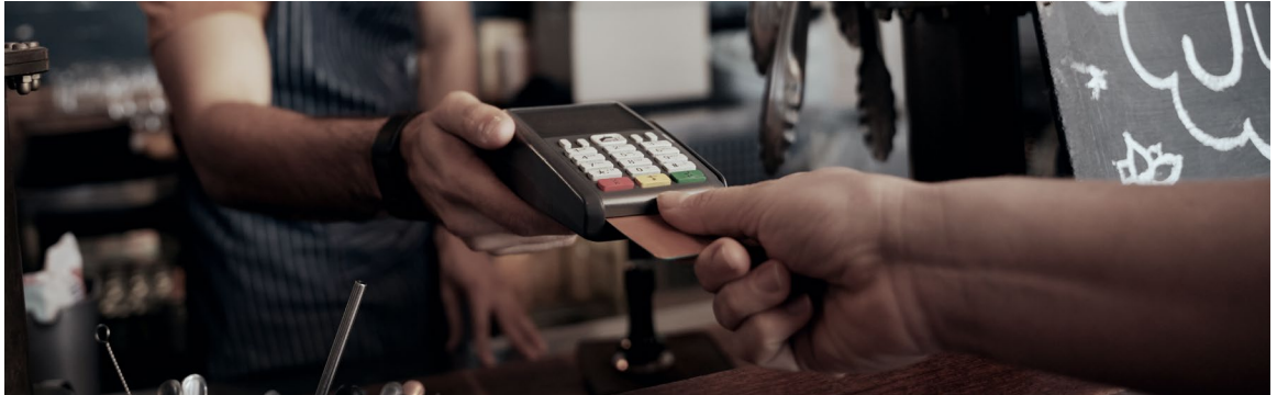
Customer: A national fast food restaurant chain